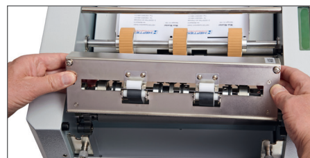
The blade magazine can easily be removed and changed, e.g. for perforating or creasing blades