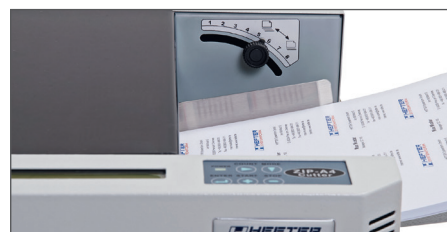
Easy operation and individual adjustment of the paper thickness

The cutted cards are stacked in an adjustable tray and are easily accessible for the operator. The cutting and slitting knives are extremely strong, and ensure an always professional look of the cards, even after a high quantity of cuts.