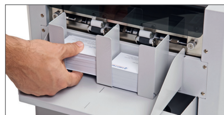
Infinitely variable, magnetic, stacker