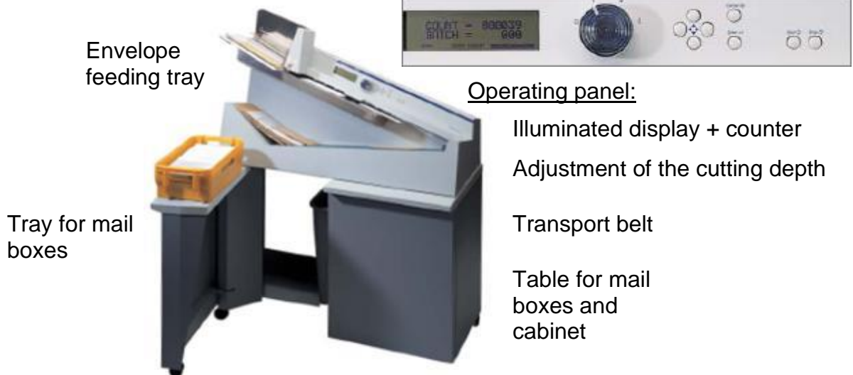
Envelope feeding tray