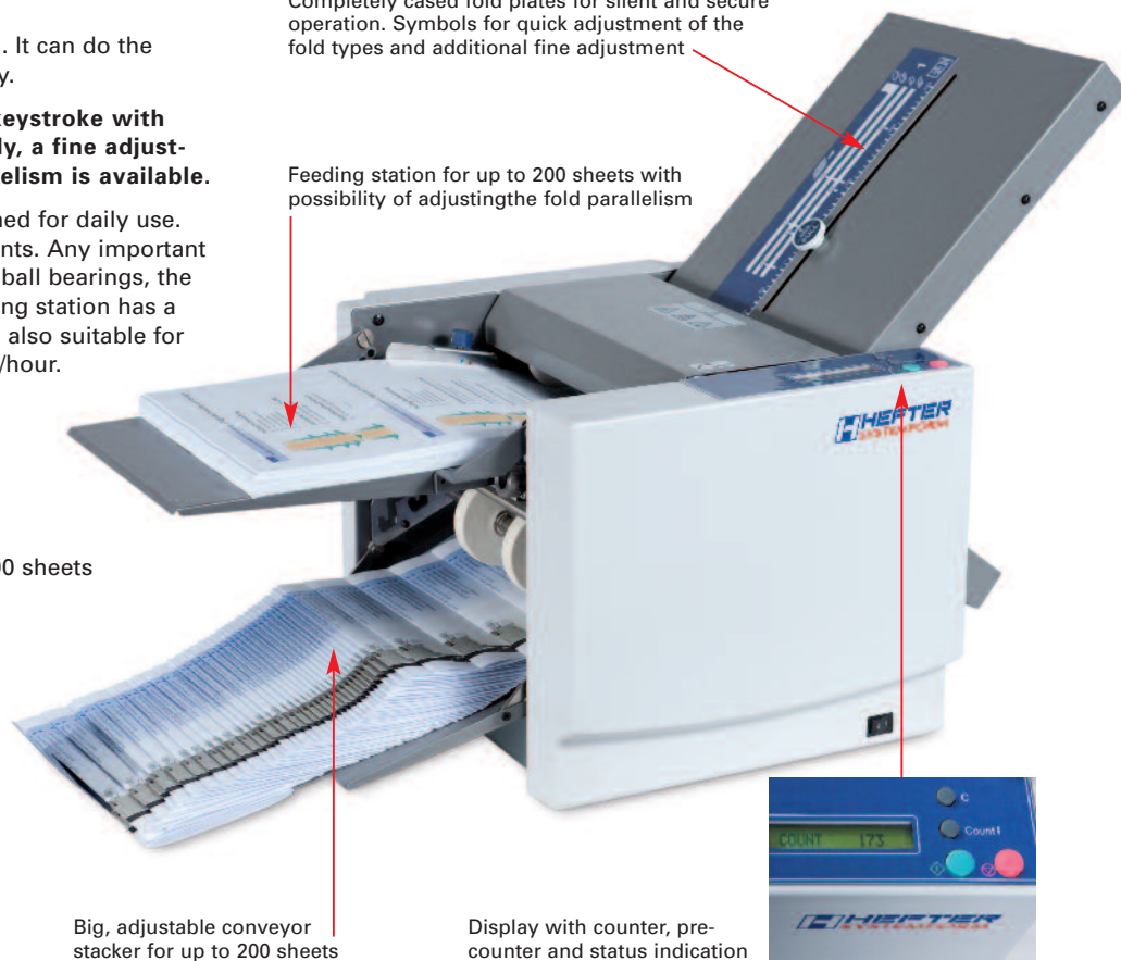
Big, adjustable conveyor stacker for up to 200 sheets

Feeding station for up to 200 sheets with possibility of adjusting the fold parallelism