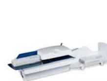
Letter opener OL 440