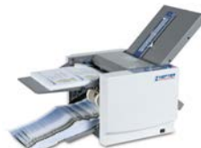
Folding machine TF Mega-S