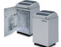
Shredder KOBRA 260 TS