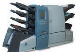
Inserting system SI 4400