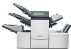
Inserting machine SI 3350