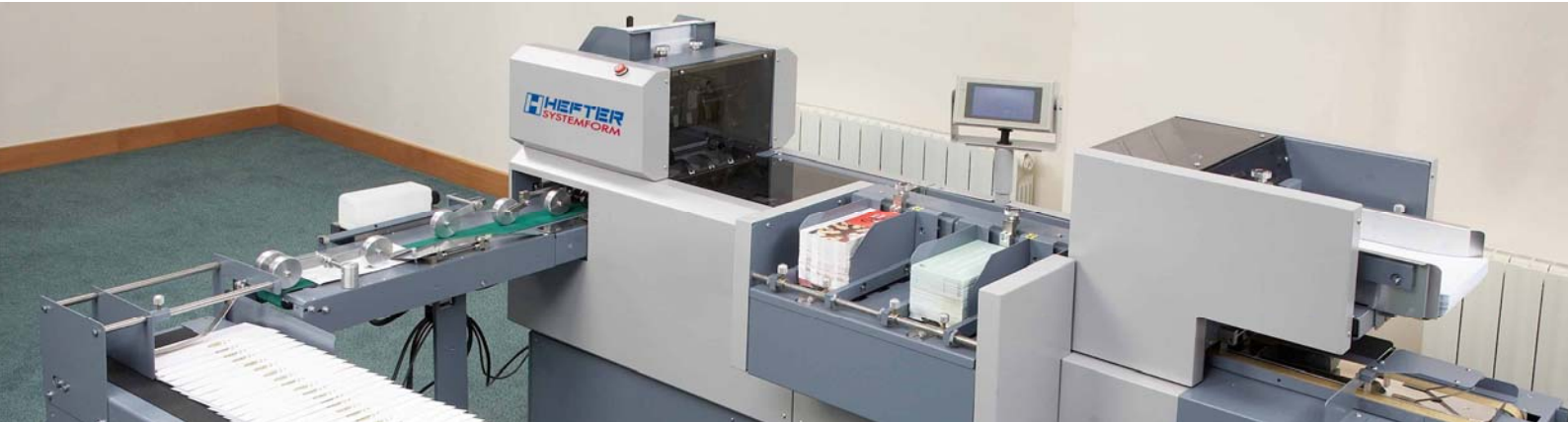
The flexible and powerful midrange inserter-solution