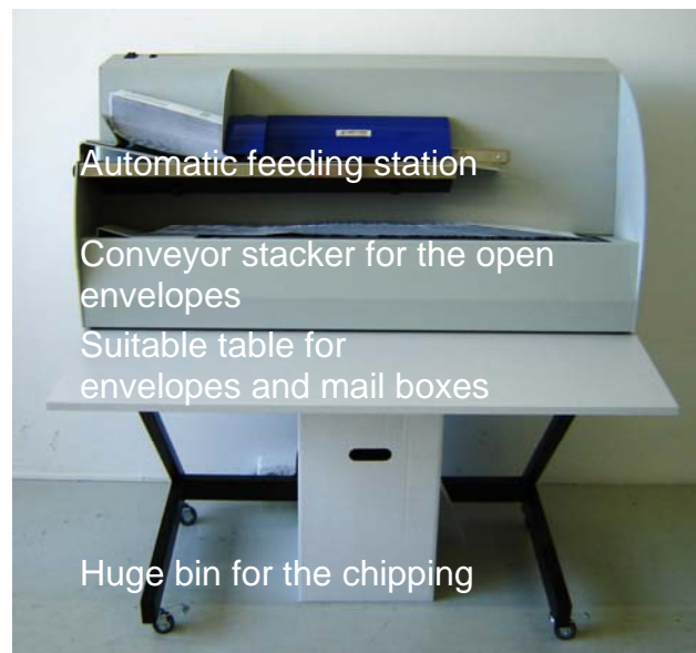
Automatic feeding station