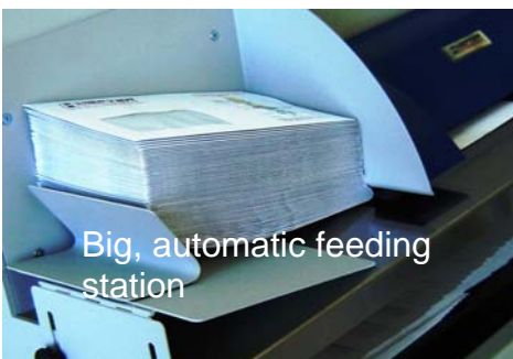
Big, automatic feeding station

The waste pin offers enough space for the chipping of about 10.000 envelopes.